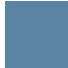
8 Chalking Units